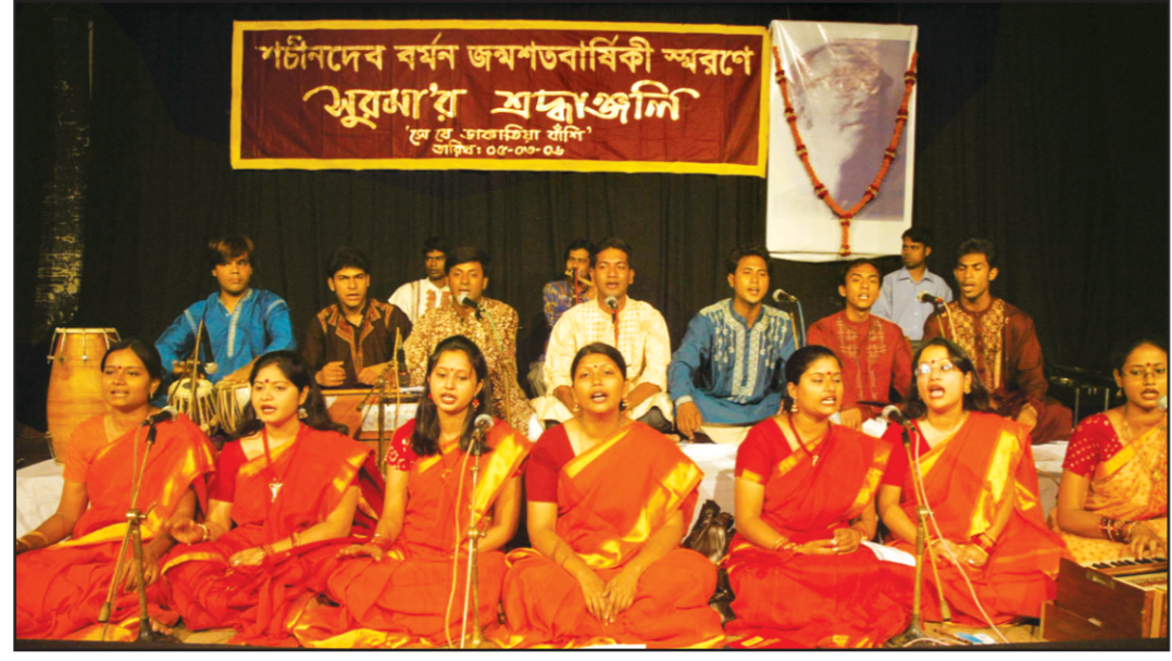
Artists of Surma presenting timeless songs of SD Burman