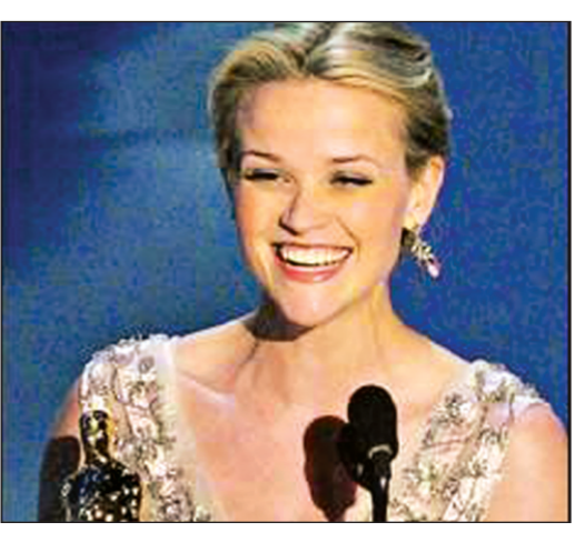
An elated Reese Witherspoon

The first major award of the evening, for supporting actor, was accepted by George Clooney, who as a producer had cast himself as the CIA Middle East opera-