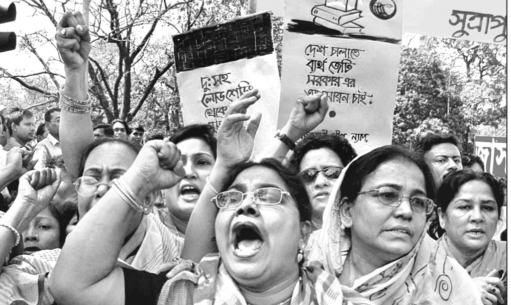
14-party stages a demonstration in the city yesterday demanding uninterrupted power supply during peak boro season and SSC examinations.