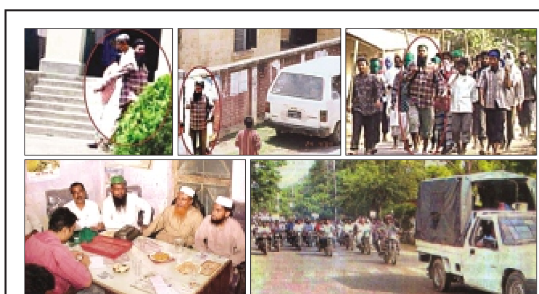
Past speaks: These pictures show how Bangla Bhai was protected by the administration in his heydays. The militant chief comes out of the Rajshahi police super's office and speaks to his cadres; he marches through village; A The Daily Star reporter interviews him at a UP chairman's office; a police van escorts his procession.