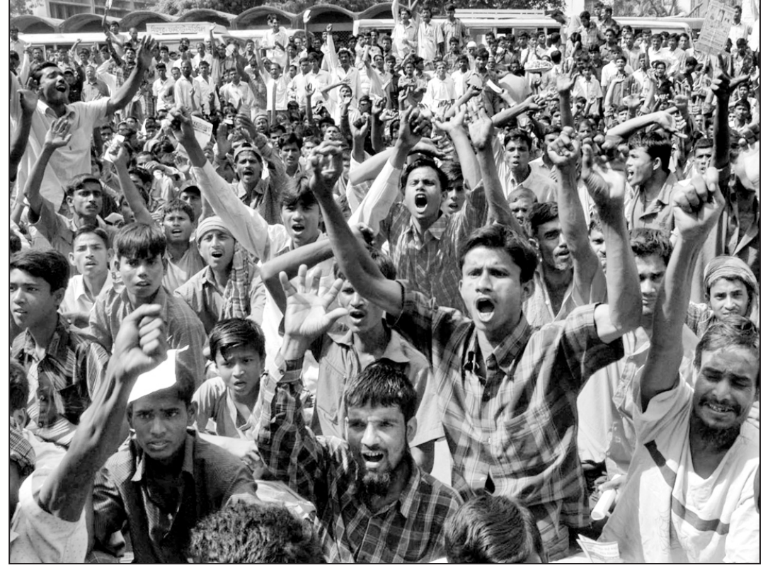
Rickshaw-Van pullers-Owners Oikya Parishad stages a demonstration at Muktangan in the city yesterday in protest

Locals rushed Utpal to the emergency of Chittagong Medical College Hospital where the on-duty doctors pronounced him dead