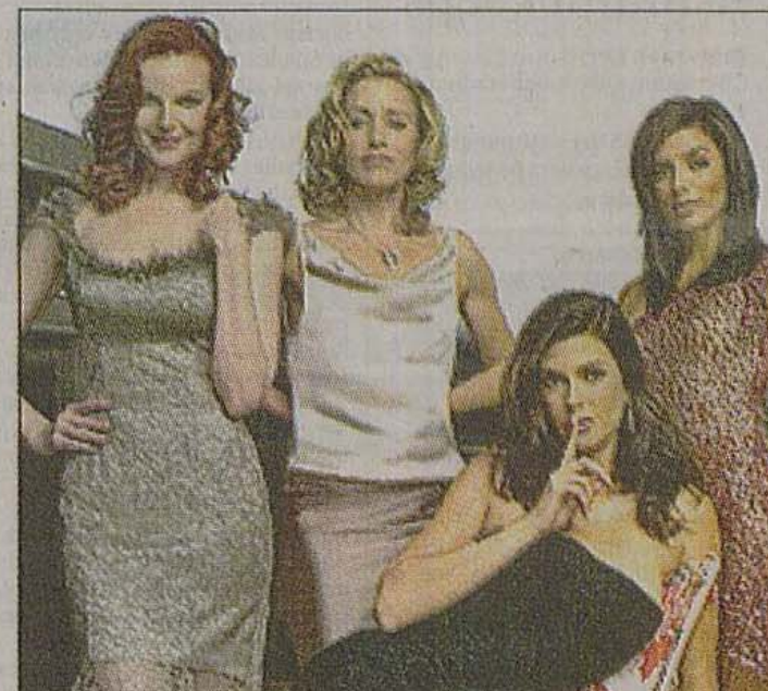
The cast of Desperate Housewives

Wisteria Lane is getting a Latin makeover. Latin America will be getting its own version of the ABC hit drama Desperate Housewives this summer -- actually make that four versions. In an unusual move, Buena Vista International Television Latin America will shoot editions of Desperate Housewives for four different markets: Brazil, Argentina, Ecuador and Colombia. Complete with their own casts and tweaked scripts to reflect local language and cultural flavour. In Latin America, viewers have long seen American programmes but rarely remakes. Shows, including Desperate Housewives, are mostly dubbed or subtitled. The show is currently exported to some 200 territories around the globe. Starting in April, 23 episodes of Amas de Casa Desesperadas/Donas de Casa Desesperadas will be produced by Pol-Ka Producciones in Buenos Aires, where a Latin version of the Wisteria Lane set, the Desperate Housewives neighborhood, is being built as Calle Manzanaras. Some key changes for Latin America: The plumber will have a white-collar occupation, such as engineer, because a plumber living in a ritzy neighborhood strains credulity in some Latin American countries. The Hispanic couple in the ABC version, Carlos and Gabrielle Solis, will be recast as a foreign couple from another Latin American country. Characters' names will be Hispanicised; Gabrielle will become Gabriela; Susan, Susana; Bree, Elisa; and Lynette, Lia.