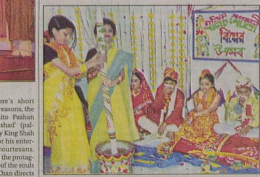
Models act out a traditional wedding at the event