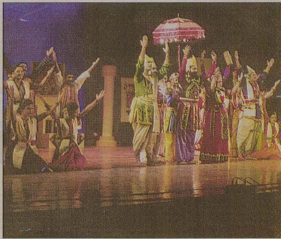
A colourful portrayal of the musical by the artistes