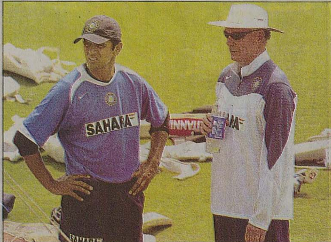
India captain Rahul Dravid (L) and coach Greg Chappell relax during a practice session at the VCA Cricket Ground in Nagpur on Tuesday.