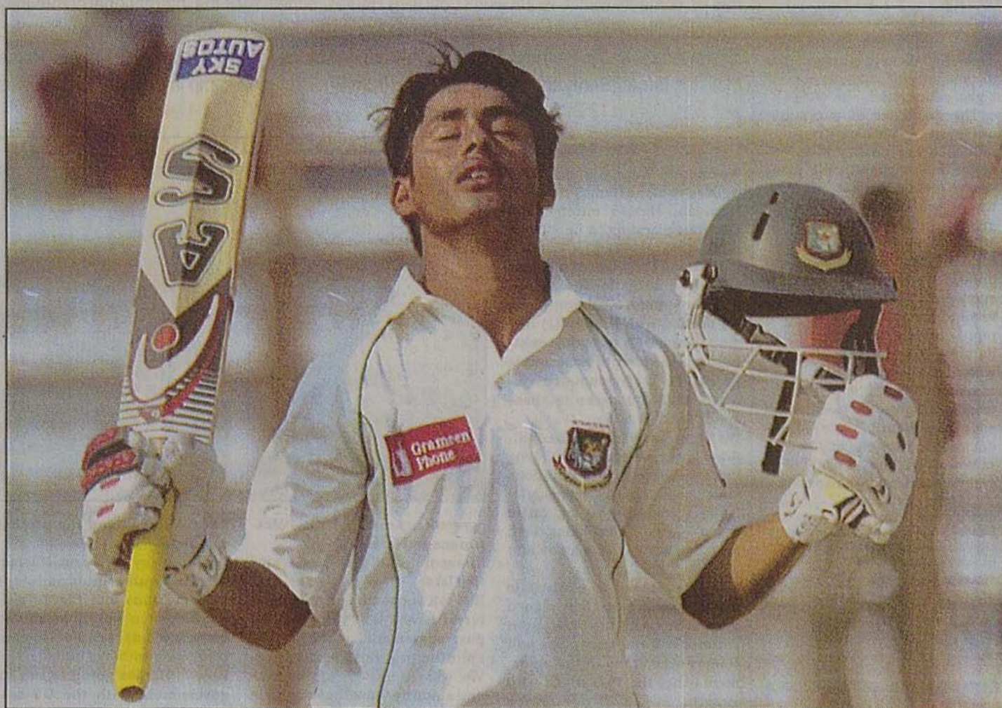
HERE I AM: Mohammad Ashraful looks to the heavens after completing his century on the first day of the first Test against Sri Lanka at the Chittagong Divisional Stadium on Tuesday.