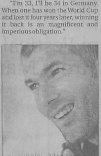
ZINEDINE ZIDANE Zidane, who will play his 99th match for France on Wednesday.

France will go to Germany believing they can win the World Cup and with a team good enough to do so, a defiant Zinedine Zidane told sports daily L'Equipe on Monday. "The World Cup is not an important objective, it's the greatest objective. We'll go to Germany to win the World Cup," the French playmaker said in an interview published as France were assembling before Wednesday's friendly against Slovakia. "We are not going to play a World Cup just for the pleasure of taking part. I don't know if we'll win it but we can make it, I'd stake my life on it," he added.