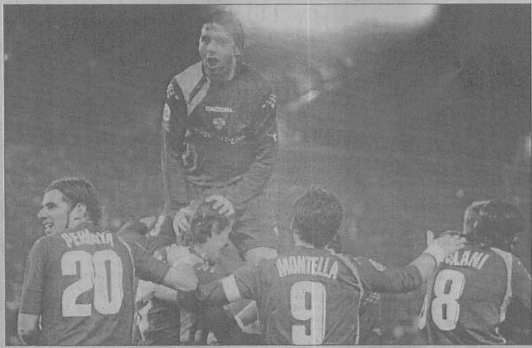
AS Roma defender Cristian Chivu (above) celebrates the first goal against Lazio with his teammates during their Serie A clash at the Olympic Stadium in Rome on Sunday.

Swimming was one of the original sports in the first modern Olympics, held in Athens in 1896. Until 1908, the competition took place in the sea.