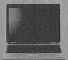
Satellite M50-P346 Model No.: PSM51L-02G015