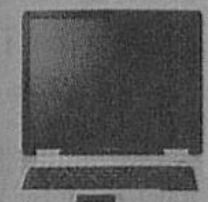
Satellite L20-C430 Model No.: PSL2XL-01R007