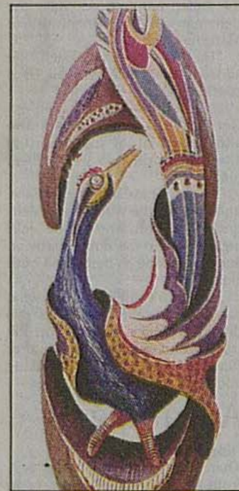
(Top) Owl's Family, (Bottom L-R) Lady & Bird 12 and Peacock

Mukh O Mukhosh is a table with several legs. The blue and gray table is decorated with many faces of wizened men with long, trailing beards. Roots Table is a piece of furniture with legs carved out of the roots of a gigantic tree. An idyllic image of birds is seen in Owl's Family. Here an owl, its mate and young ones are seen resting on a single branch of a tree. A dolphin carefully balancing a ball is seen in Circus-4. The fins and tail of the fish have been decorated with minute strokes of blue and red.