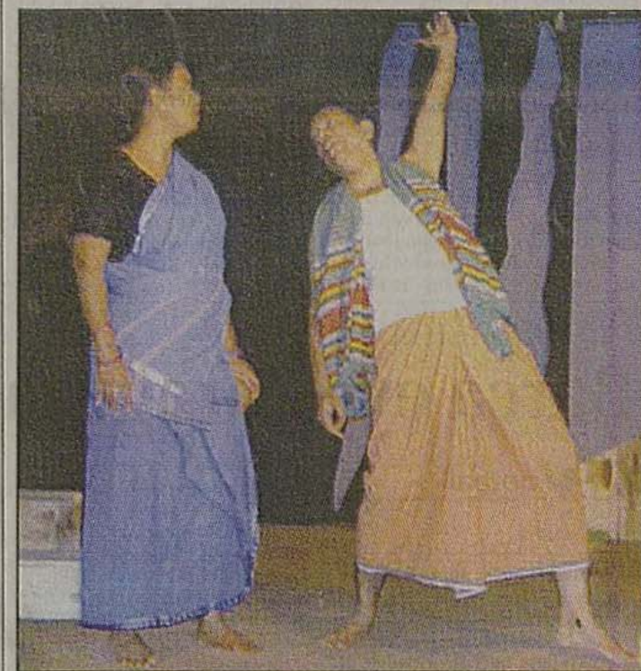
A scene from Balad