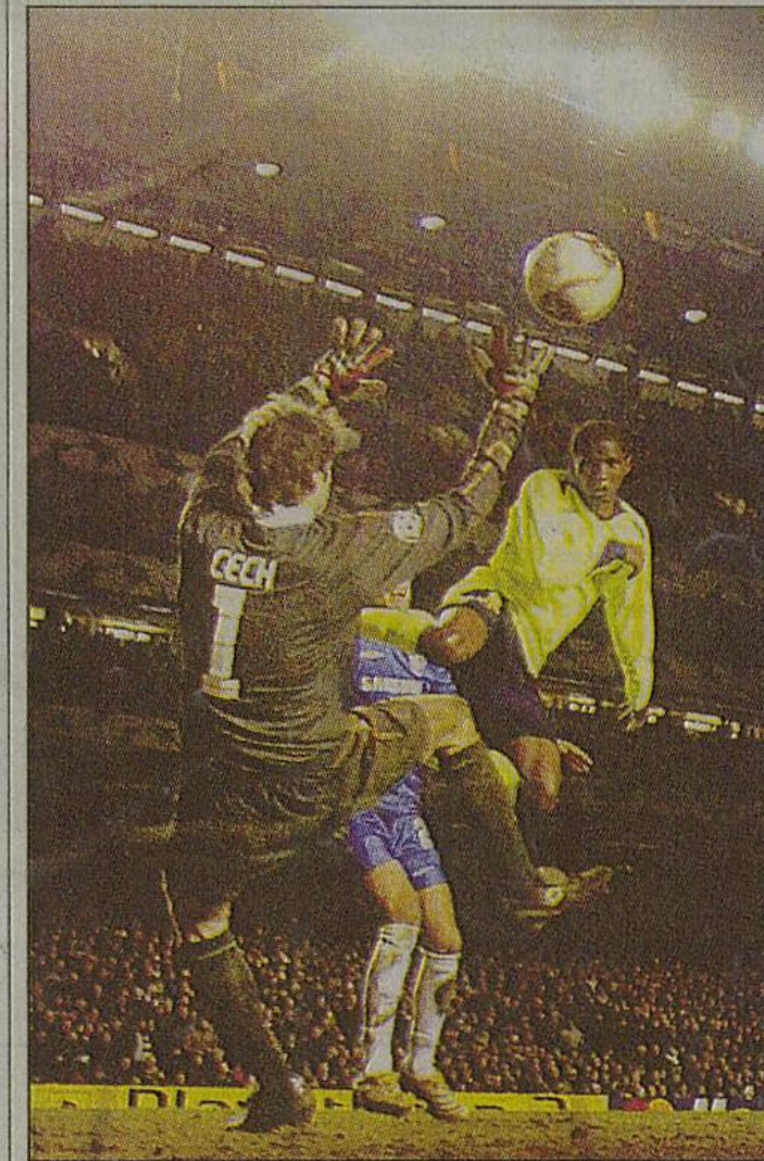
AIR ETO'O: Barcelona's Samuel Eto'o (R) rises to head in the winner in the 2-1 Champions League victory over Chelsea at Stamford Bridge in London on Wednesday.