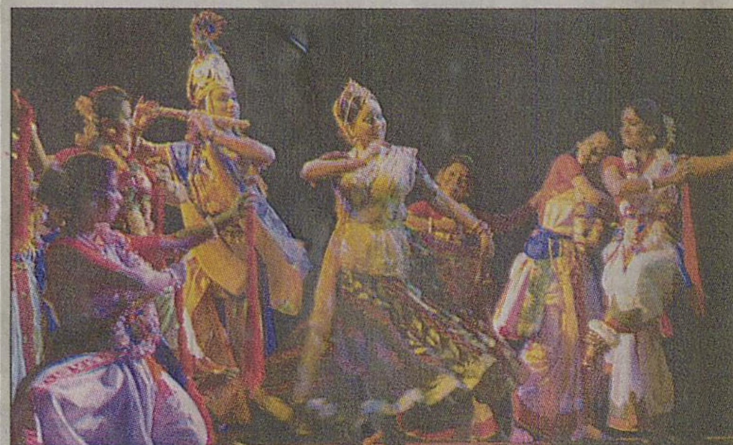
Artistes of Nriyadhara perform a dance number at the inaugural programme