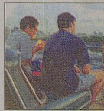
A scene from John and Jane