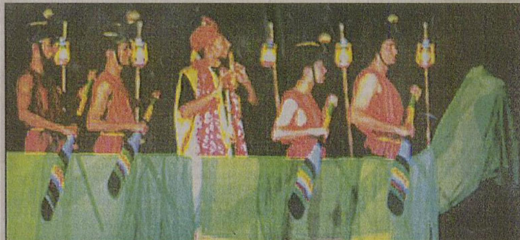
A scene from the play Sonai Bibir Pala