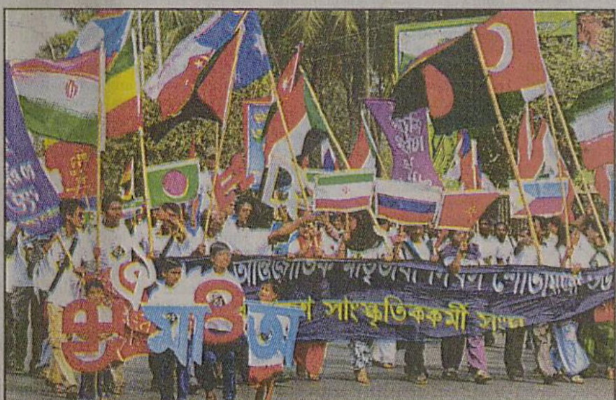
Carrying national flags and alphabets of different countries, the Bangladesh Sangskritik Kormi Sangha takes out a colourful procession marking the International Mother Language Day in the city