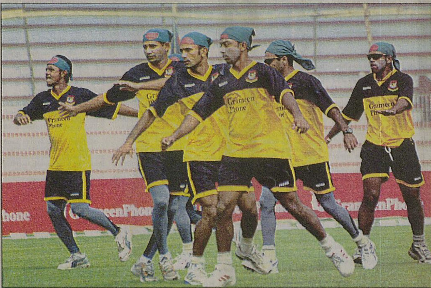
REMEMBERING 'EM IN A DIFFERENT WAY: Bangladesh cricketers with their heads draped in national red and green colours train at the Shaheed Chandu Stadium on February 21, the Language Movement Martyrs Day.

Bangladesh vs Sri Lanka 2nd ODI Venue: Shaheed Chandu Stadium, Bogra