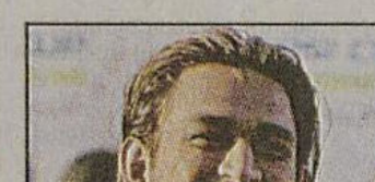
MAHENDRA SINGH DHONI