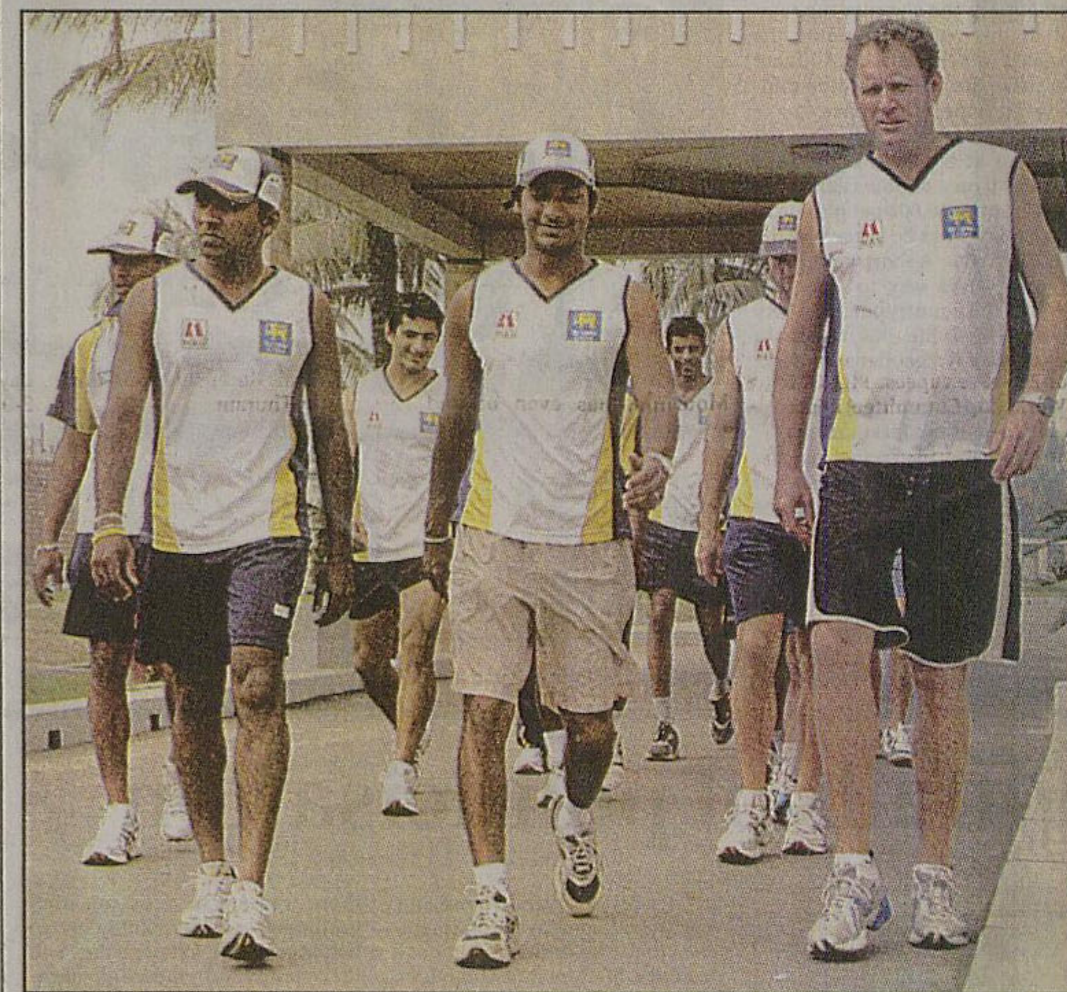
AFTER YOU SIR: Sri Lankan coach Tom Moody (R) leads his charges out of the team hotel at Bogra on Tuesday.

"Yes, I was successful at number three but I still believe that Aftab and Ashraful are better than me to use the fielding restrictions because they can naturally play over the top," he explained.