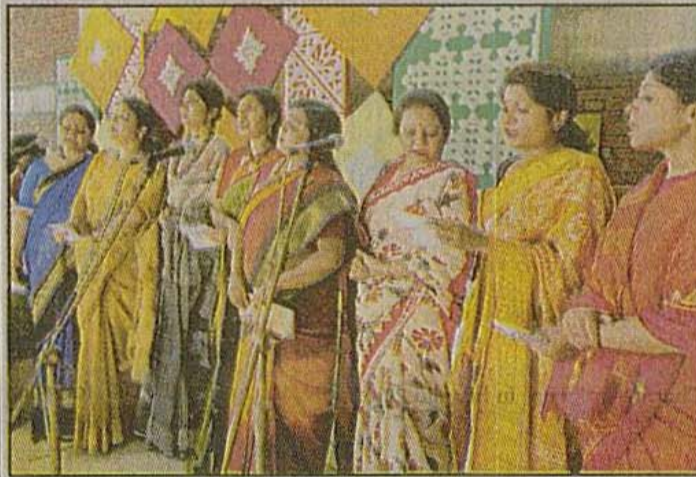
Artistes render a song at the venue of Chhayanaut Bhaban