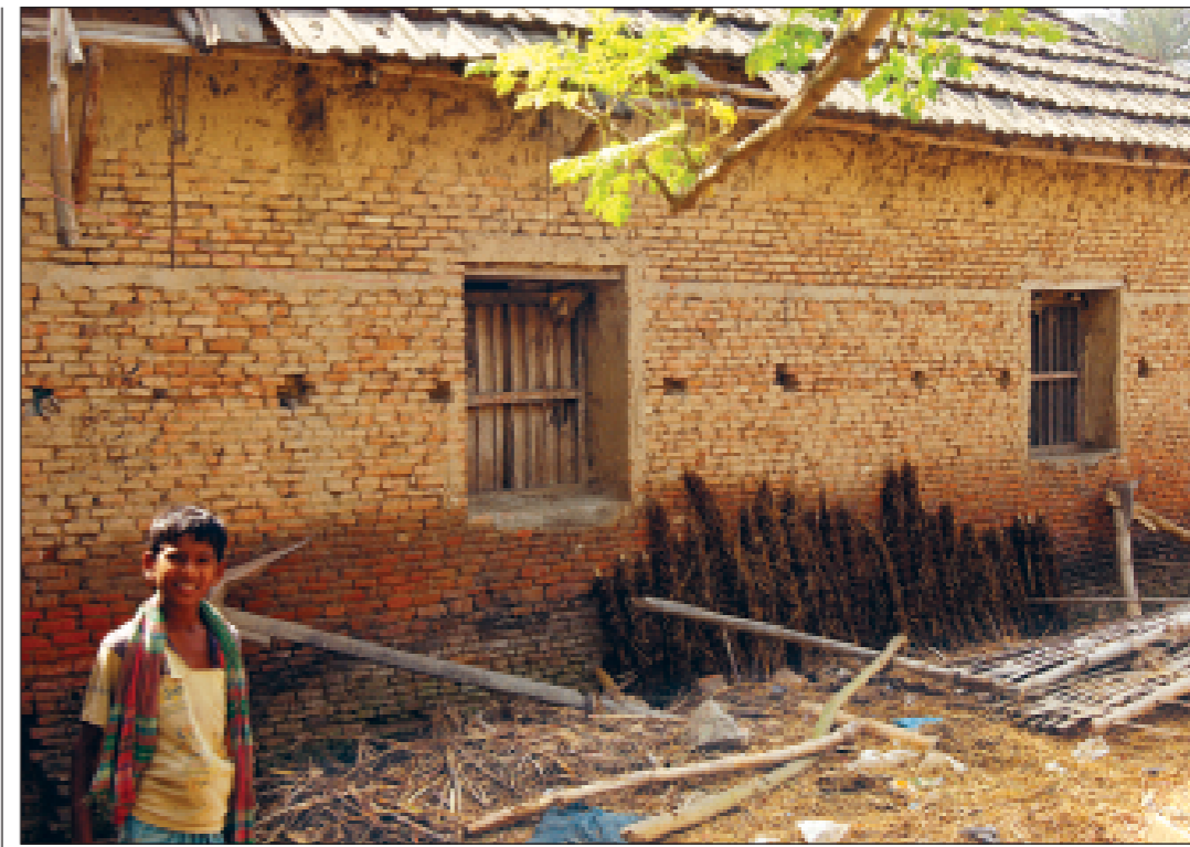
A house built entirely with remains of the ancient Bengal capital of Gour in Chapainawabganj although these should be preserved for their historical value.