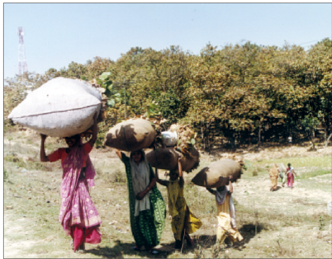
Rural women return home after collecting fallen leaves from the forest at Chandra in Gazipur to use those as fuel for cooking.