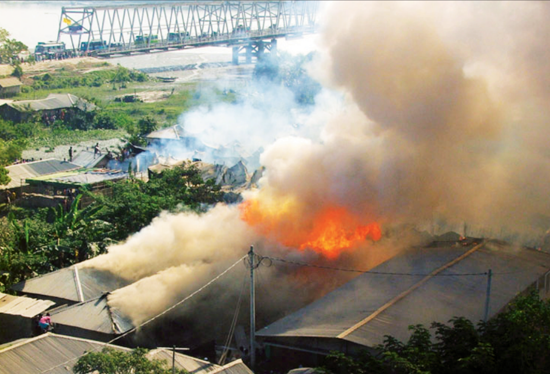
Huge plumes of smoke rise into the air above the sites of the fire at a warehouse of imported cargo at Madarbari, left, and at a slum adjoining the Natun Bridge at Chaktai, right.