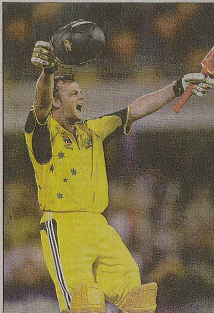
ON A RAMPAGE: Australian batsman Adam Gilchrist is ecstatic on reaching his century off just 67 balls during the third and last triangular one-day series final against Sri Lanka in Brisbane on Tuesday.