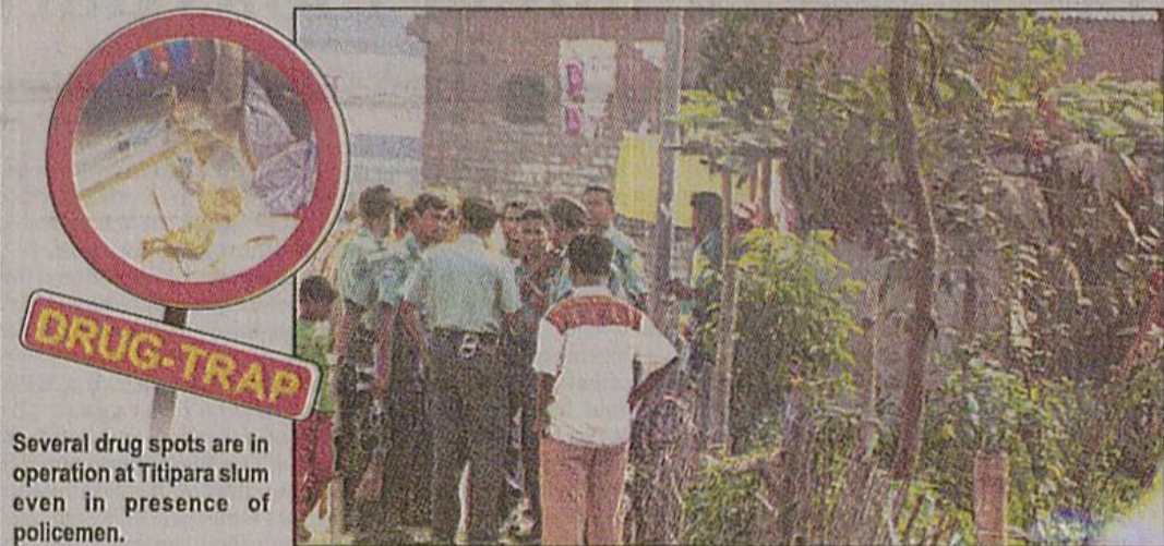
Several drug spots are in operation at Titipara slum even in presence of policemen.