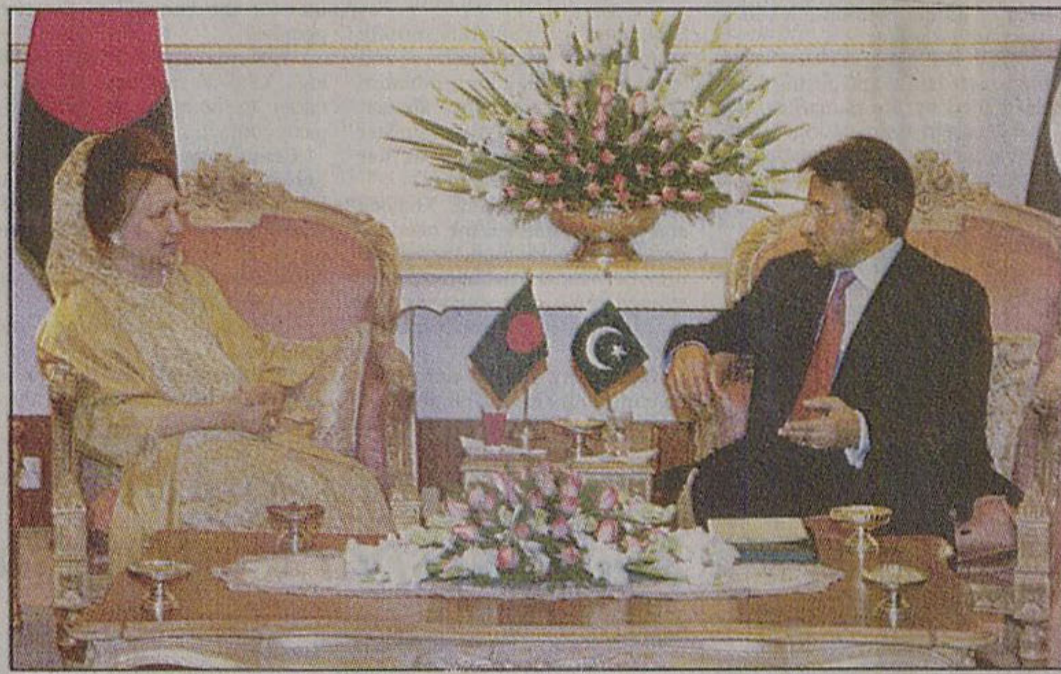
Prime Minister Khaleda Zia talks with Pakistan President Pervez Musharraf in Islamabad yesterday before wrapping up her three-day state visit to Pakistan.