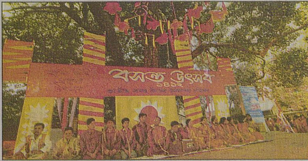
The colourful celebration at Charukala premises

The main attraction of Pahela Phalgun was the cultural event at Bakulatala premises of Institute of Fine Arts, DU. Renowned cultural activists of the country under the banner of Jatiyo Bashonto Ushob Ujjapan Parisad arranged the programme.