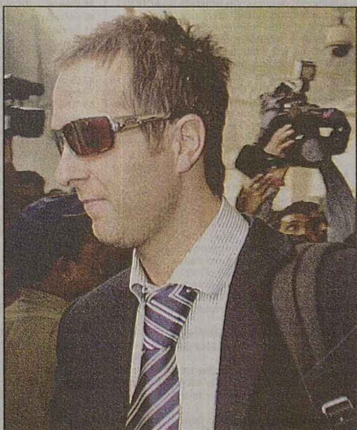
England captain Michael Vaughan upon his arrival at the airport in Mumbai on Monday.

Rahul Dravid's Indians are currently touring Pakistan where they lost the Test series 1-0 but defeated Sri Lanka 2-0 at home earlier in the season.