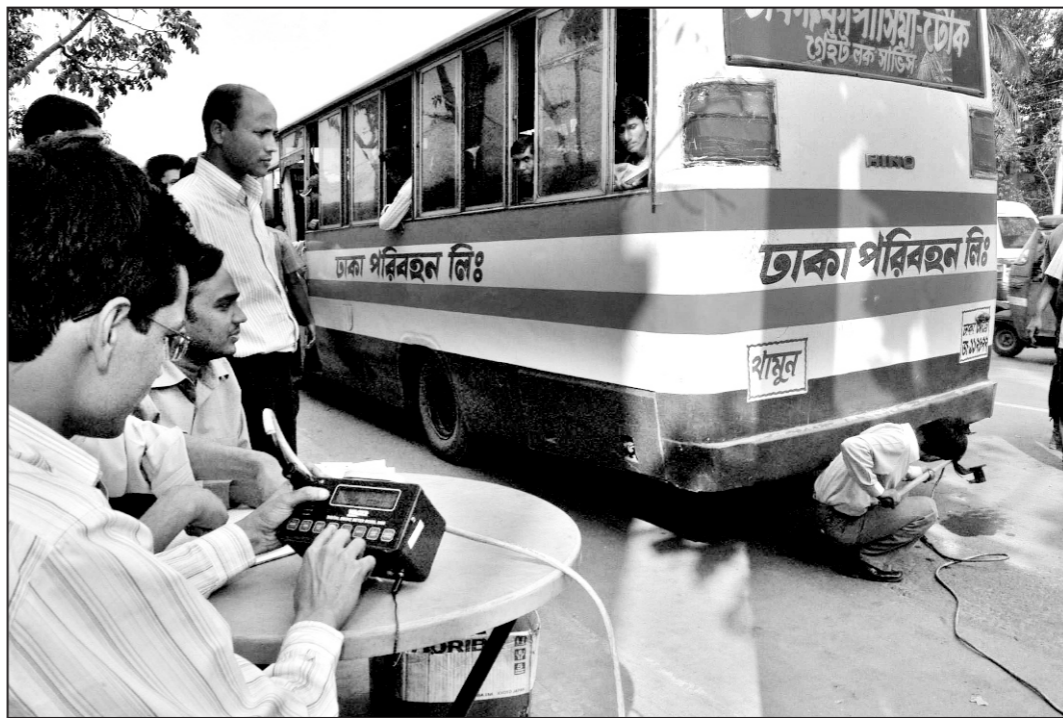
A mobile team of the environment directorate measures emission of black smoke from a bus at Tejjaga area in the city yesterday.

Later, Todd M Sorenson officially launched the three-year DLGP-USAID programme that will work in 70 union parishads and 15 municipalities in Northwest and Southwest parts of the country.