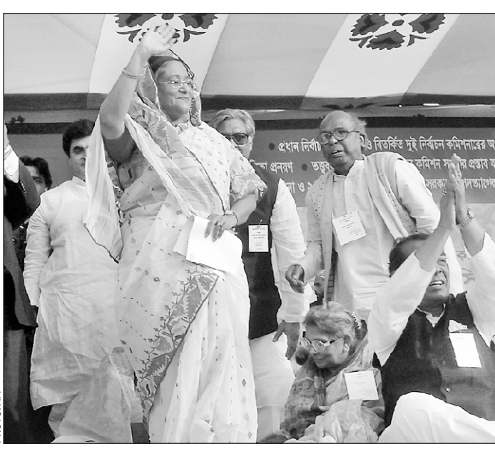
In a mammoth public meeting after the long march, opposition leader Sheikh Hasina spoke and the whole country listened. I did too. Through your newspaper I would like to ask her a few questions related to her speech and may I request her to reply.

the proposals for reforms in the caretaker government and election system. This is an encouraging spirit, which we all wanted her to show a long time back. My question to her is, why couldn't she show it earlier? "But if the government refuses to carry out the proposals in the letter, we will resign all together." Is this a responsible statement? This means that she does not believe in any parliamentary debate or arguments on her proposals. Then why does she not just send her proposals by a courier service? "Hasina called on the administra-