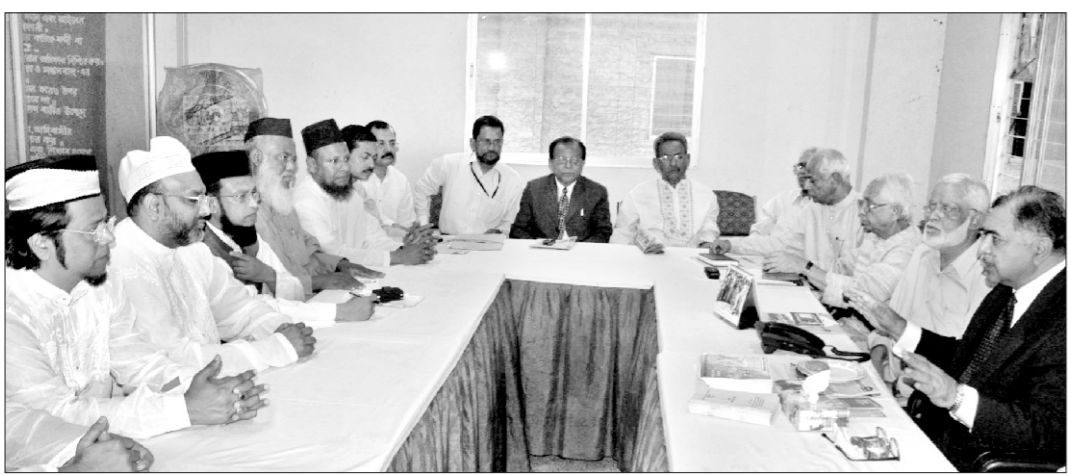
Jatiya Oikya Mancha President Dr Kamal Hossain speaks at a meeting with Bangladesh Tarikat Federation at the Eden Complex in the city yesterday.

People aged above 18 years and weighing over 45 kilograms will be employed only in camel training, the major who is also facilitating the total repatriation process on the UAE part said. The UAE had banned using children aged below 18 years and weighing less than 45 kilograms as camel jockeys following international pressures. The UAE has sent 1034 former camel jockeys to Pakistan, Bangladesh, Sudan and Mauritania and only 24 are waiting repatriation in the deportation cell in Dubai. The UAE government is also paying $1000 to each of the children as compensation, he added.