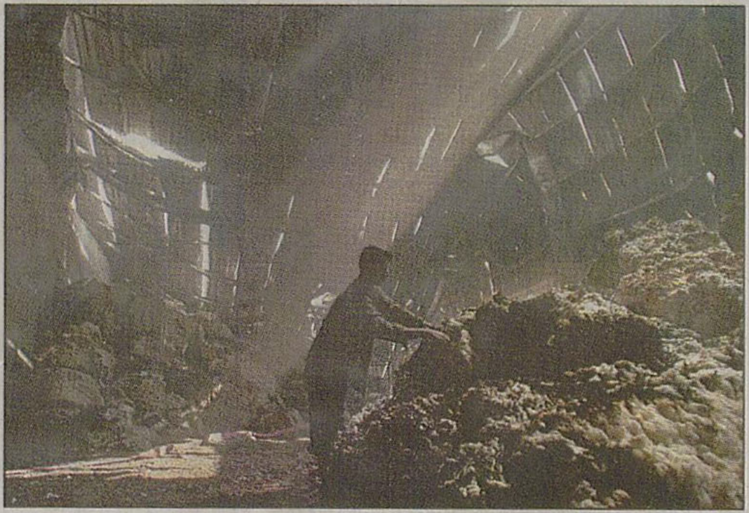
A man picks a bit of cotton inside the burnt down Jamuna Spinning Mill in Gazipur yesterday. The fire left six people dead and three injured.

Fire Brigade and Civil Defence sources said the fire could have originated from friction of the machines while the mills authorities suspect electric short-circuit as