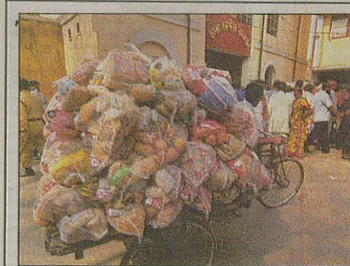
A rickshaw-van overloaded with food items for mass arrest victims makes way to Dhaka Central Jail gate yesterday.

She said publishing the imaginary cartoon of Prophet Hazrat Muhammad (SM) has hurt the feelings of the Muslims all over the