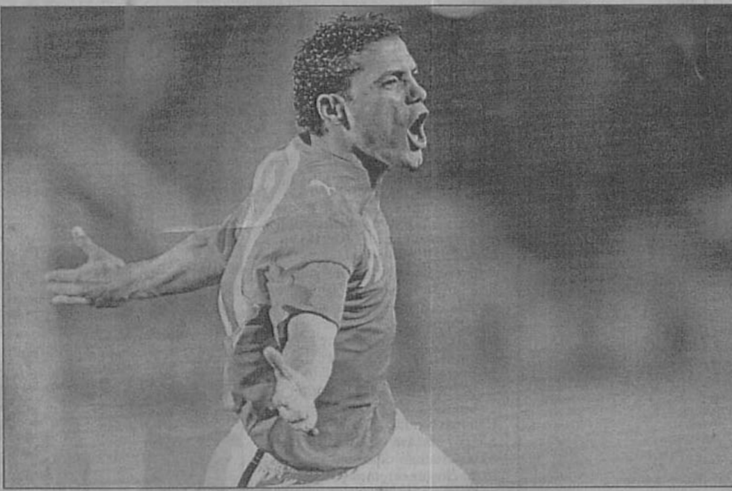
Egypt forward Amr Zaki celebrates his strike against Senegal in the African Nations Cup semifinal in Cairo on Tuesday.

SYLHET: 193-9 in 50 overs (Rahman 36, Mawla 66 n.o., Rana 24, Anis 3-16, Nadif 1-32, Ayub 1-20, Humayun 3-15). Result: Barisal won by 109 runs.