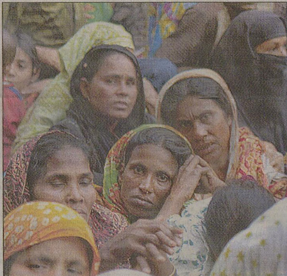
Relatives wait anxiously in front of Dhaka Central Jail gate for release of their near and dear ones detained during the 'blanket arrest' ahead of the opposition's February 5 long march. The photo was taken yesterday afternoon.

SHARIFUL ISLAM The plight of hundreds of relatives of the mass arrest victims continue due to the slow pace of release of the detainees, who have been granted bail, from the Dhaka Central Jail. The jail authority released 400 detainees yesterday; with this, 1,448 people were released up to 8:00pm yesterday during the last four days. Finding no shelter, the relatives, mostly poor, have been spending the nights under the open sky at the jail gate. Many relatives were found staring at the jail entrance, standing under the sun, with hopes that the next person coming out of the jail might be their dear one. Many were seen waiting with notes of the bail order issued even back on February 6. Talking to the relatives waiting at the jail gate, it was found that mostly poor people were the victims of the blanket arrest ahead of the 14-party opposition combine's long march to Dhaka last February 5. Almost all of the victims are rickshaw-pullers, wayside vendors, tailors, garage SEE PAGE 15 COL 1