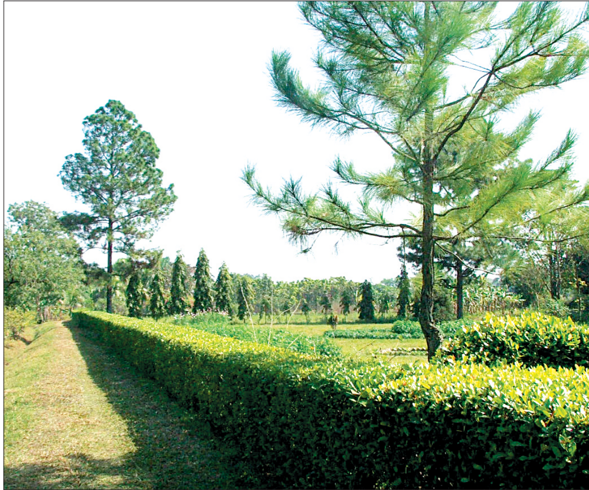
Different species of flowers in bloom at the Botanical Garden at Chittagong University, left, and a view of the garden, right.