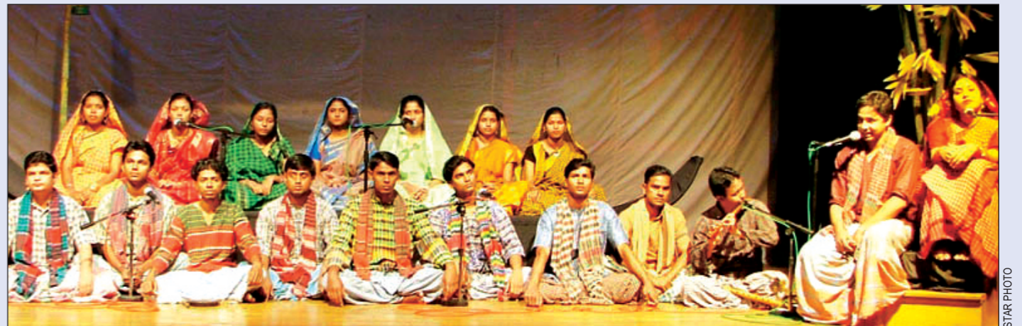
Artistes of Proma, a recitation group, stage Sojan Badiyar Ghat, a drama by Pallikabi Jasim Uddin, at the Theatre Institute hall on Wednesday.