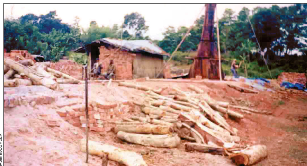
Logs lie in heaps for use as firewood at a brickfield in Khagrachhari.

Forests in Khagrachhari are shrinking as brickfield owners fell trees indiscriminately