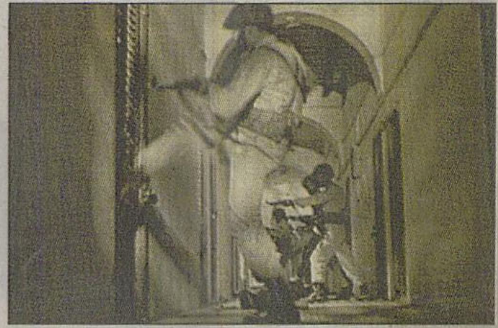
A scene from the documentary Shei Raater Kotha Boltey Eshechhi