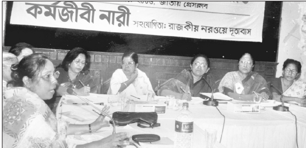
Participants at a discussion on 'Amended National Women Development Policy' held at the National Press Club in the city yesterday. Karmojibi Nari in collaboration with the Royal Norwegian Embassy organised the event.

He expressed his gratitude to the students and teachers of Sunnydale School for their donation. This will inspire other schools to help establish a full-fledged cancer hospital in the country by 2008, he added.