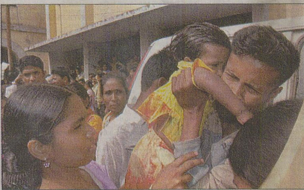
Detained on February 2 ahead of the opposition 14-party's long march, a person breaks down cuddling his daughter on release from Dhaka Central Jail yesterday.

STAFF CORRESPONDENT The tea gardens and other properties of the century old British tea company James Finley Limited will be formally handed over to Bangladeshi buyers in a formal ceremony in Glasgow, Britain next week. The local buyers and the representatives of the company exchanged views at an informal get together at a hotel in the capital last night. The Bangladeshi buyers will leave Dhaka on February 14 to attend the ceremony, according to sources. A local business consortium comprising eight leading entrepreneurs bought century old 17 tea