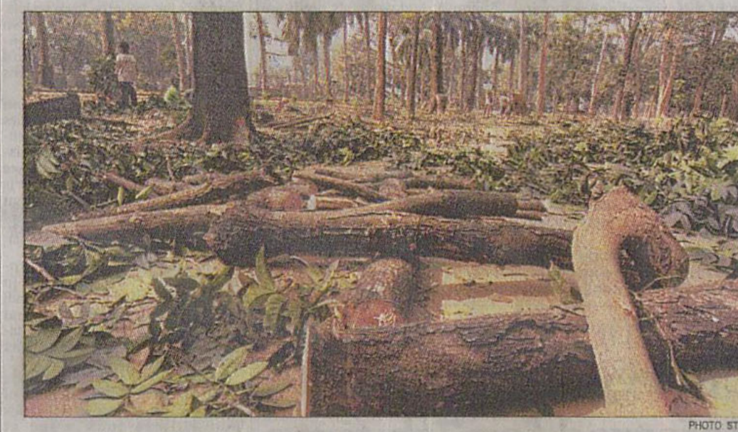
Branches of big trees litter Suhrawardy Udyan as the Public Works Department chopped them down in a bid to allow smaller trees to grow.

STAFF CORRESPONDENT The main opposition Awami League (AL), which has announced its plan to place in parliament the proposals for reforms in the caretaker government and electoral systems, might give the government a two-month time limit to implement the reforms. Following the AL announcement that came at the post-long march rally on Sunday, both the ruling four-party alliance and the opposition prepare themselves for a face-off in parliament this week for the first time over the issues of reforms. AL plans to issue an ultimatum to the government to meet the demands for reforms while the top government policymakers are busy discussing how to react to the developments that might follow once the proposals are brought forward, sources said. On returning to the House after a 16-month boycott either on Wednesday or Thursday, Leader of the Opposition Sheikh