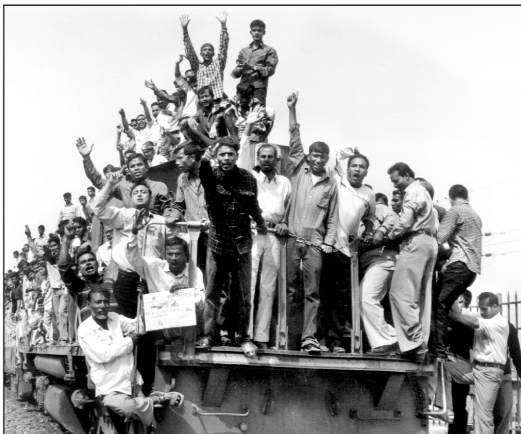
Opposition activists from different districts arrive in the city by a train yesterday as part of the long march programme of the 14-party opposition combine. The picture was taken from Airport Railway Station.

The award was handed over to the winners at a gala programme at the UBI auditorium at Kolkata Book Fair on January 28. Eminent writer Sunil Gangopadhyay chaired the award giving ceremony.