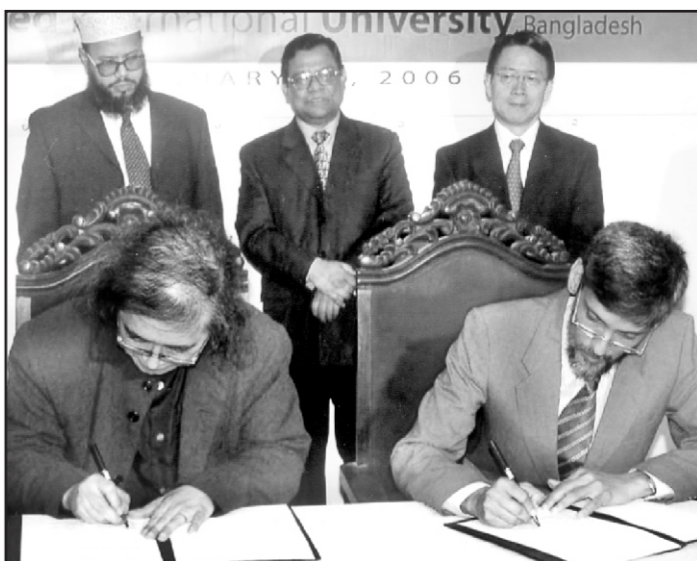
A Memorandum of Understanding (MoU) was signed between the United International University (UIU), Dhaka, and Wakkana Hokusei Gakuen University, Japan, in the city recently. Under the MoU, the two institutions will exchange programmes and the UIU will introduce a Japanese language course.

Teachers will observe a two-hour work abstention from 11:00am to 1:00pm. They will stage a one-hour sit-in at 11:00am at Battala in front of Arts Building.