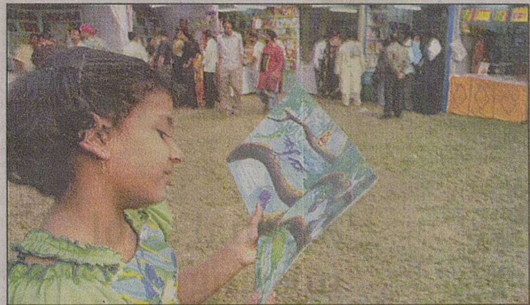
A young bookworm at the fair