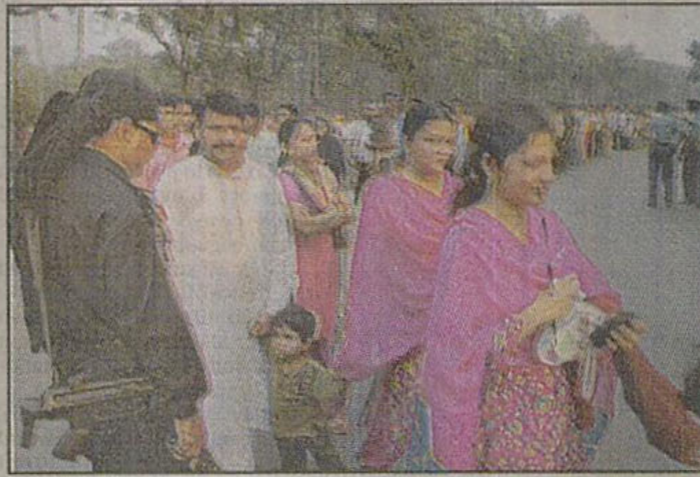
Serpentine queues at the Ekushey Book Fair