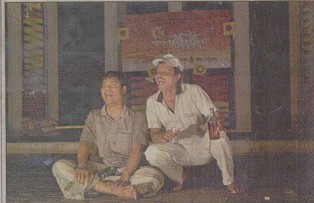
A scene from one of the plays staged at the festival

The week-long street drama festival arranged by Bangladesh Group Theatre Federation will continue till February 7.