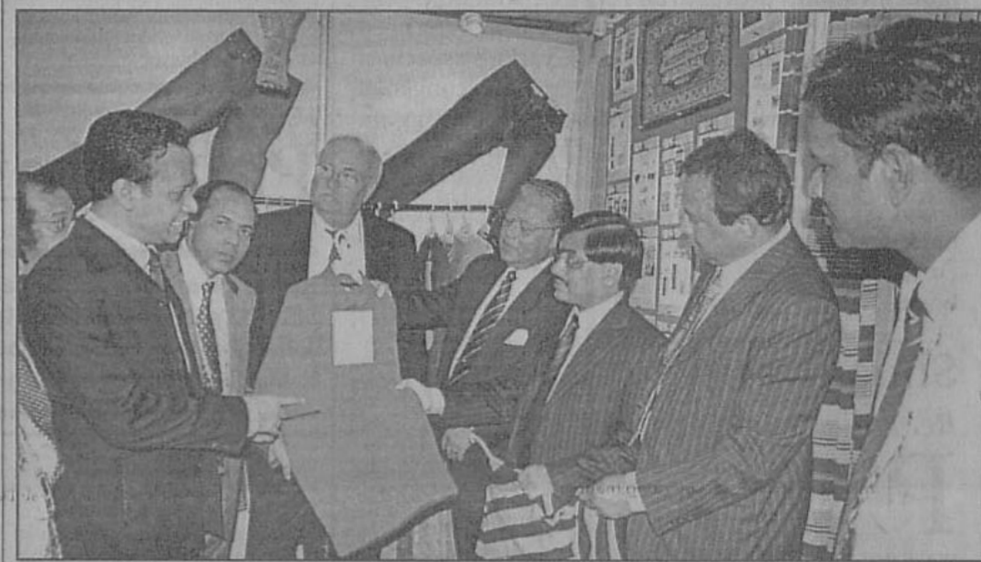
Commerce Minister Altaf Hossain Choudhury takes a closer look at an apparel after inaugurating the three-day 'Chittagong Apparel, Fabric and Accessories Exposition (Cafaxpo)-2006' at CJKS Gymnasium in the port city yesterday. Commerce Ministry Adviser Barkat Ullah Bulu and European Union Ambassador Stefan Frowein, among others, are seen.

Private consumer spending is the only driver of economic activity not seen slowing significantly in 2006, with growth targeted at 12.5 percent, compared with 12.9 percent last year.