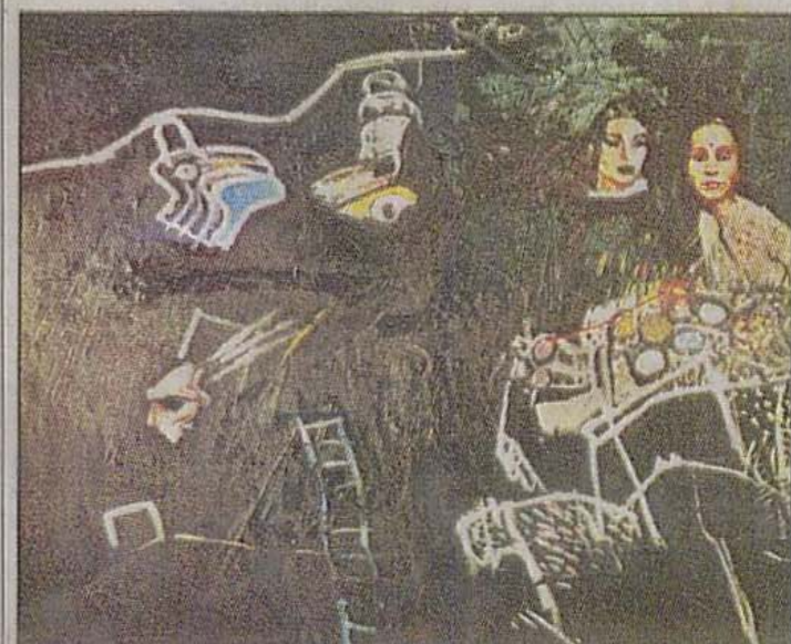
Colours of the Darkness

As for his assessment of the state of art, today, in the 21st century, he believes that there is not much individual beauty in it. He says that one artist tends to copy another. "We do not necessarily have much genuine feelings, philosophy or drive," he comments.