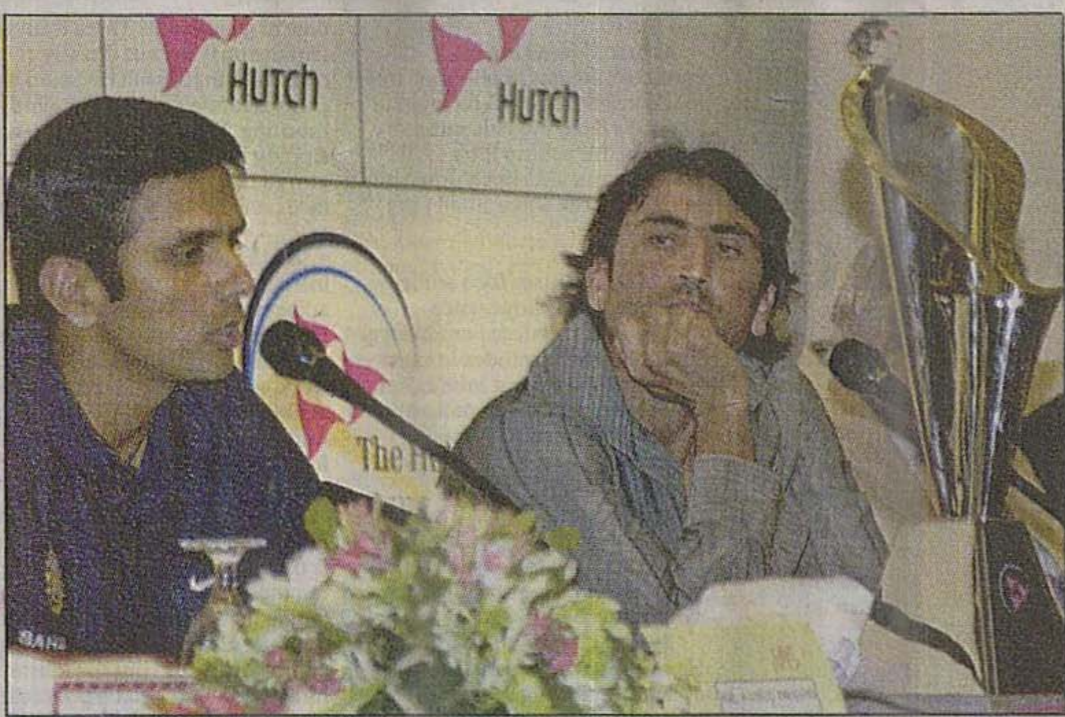
India captain Rahul Dravid (L) talks to reporters while Pakistan vice-captain Younis Khan looks on during the launching ceremony of the India-Pakistan ODI series in Karachi on Friday.