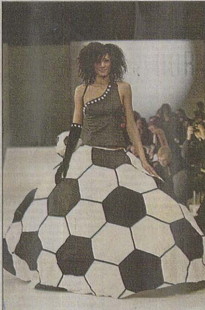
A handout picture taken on January 30 shows a model during a 'Catwalk with Ball' fashion show in Berlin. The show was themed 'football' in the year of the FIFA Football World Cup that will take place from June 9 to July 9 in Germany.