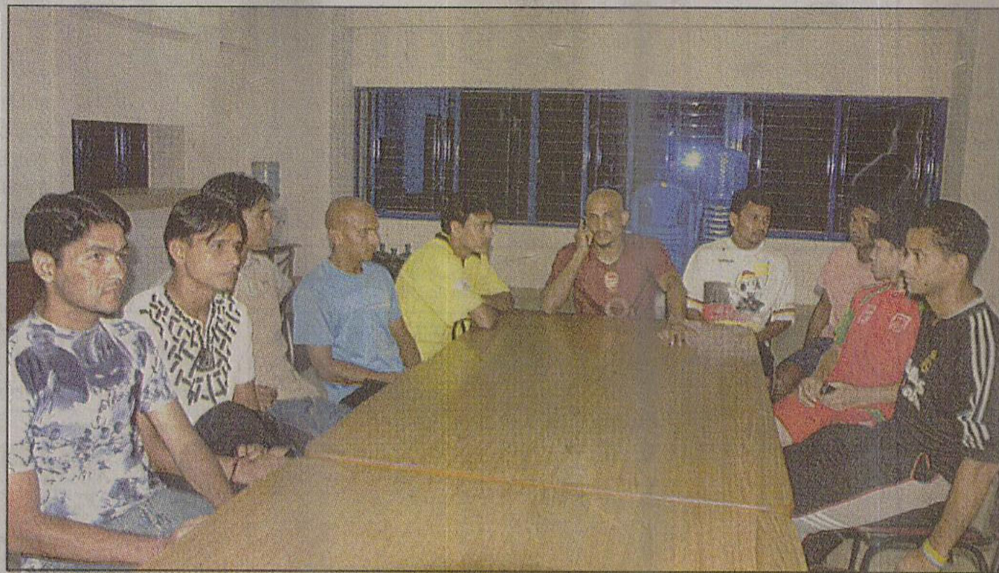
THINK ABOUT US PLEASE: The national booters, who are demanding a date of transfer from the federation, had a meeting at the BFF Bhaban yesterday.

Aktel Premier Div Cricket League SUPER SIX Old DOHS vs Victoria Sporting Venue: Fatullah Cricket Stadium Biman vs Sonargaon Cricketers Venue: Dhanmondi Cricket Stadium