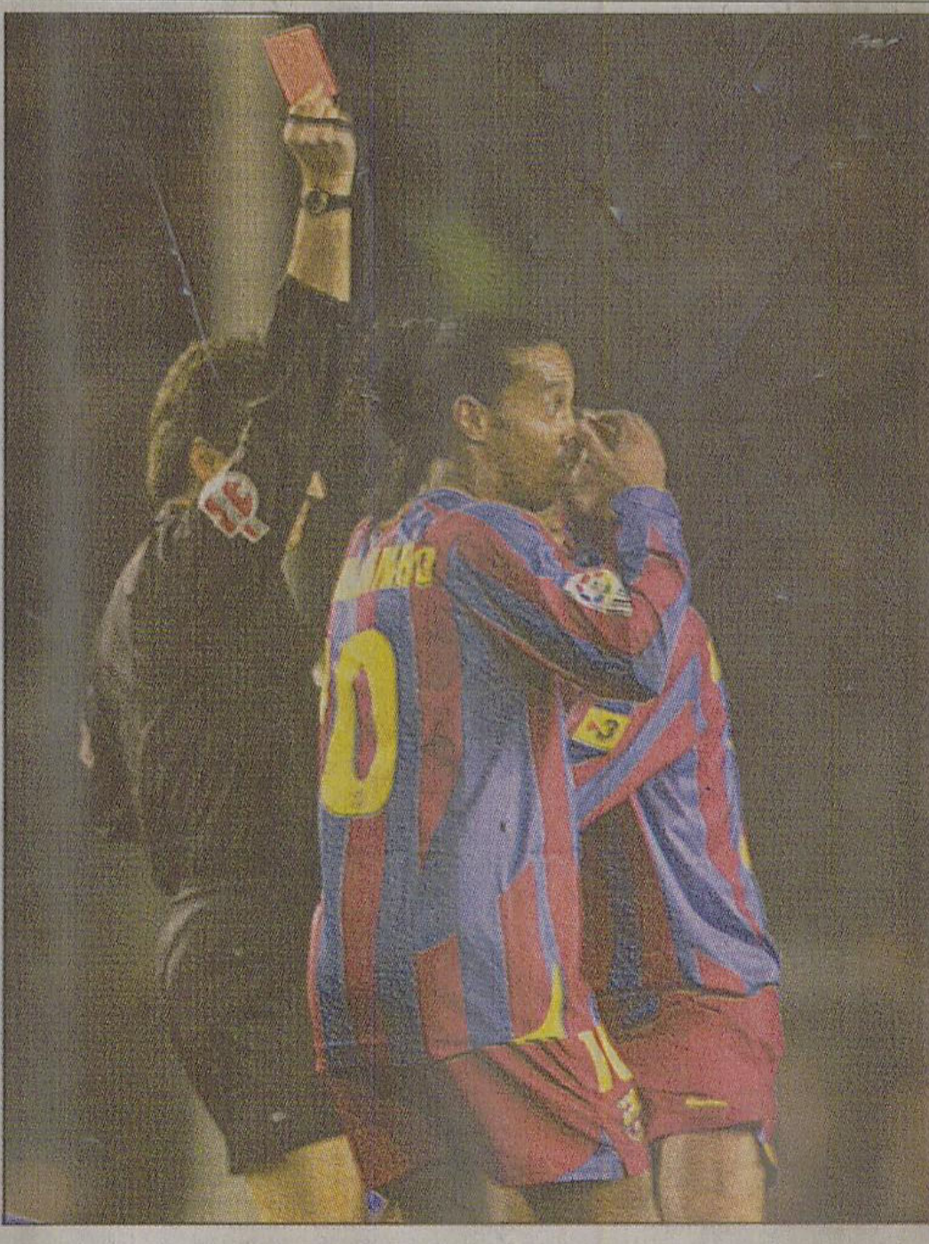
Barcelona playmaker Ronaldinho is bemused at being sent off in his side's Spanish King's Cup match against Zaragoza at the Nou Camp on Wednesday, a day of red cards across Europe that saw Manchester United's Rio Ferdinand and Juventus's Zlatan Ibrahimovic also receive marching orders.

Woolmer hoped Pakistan would carry the momentum from the Test victory through to the five-match one-day series which starts in Peshawar on February 6.