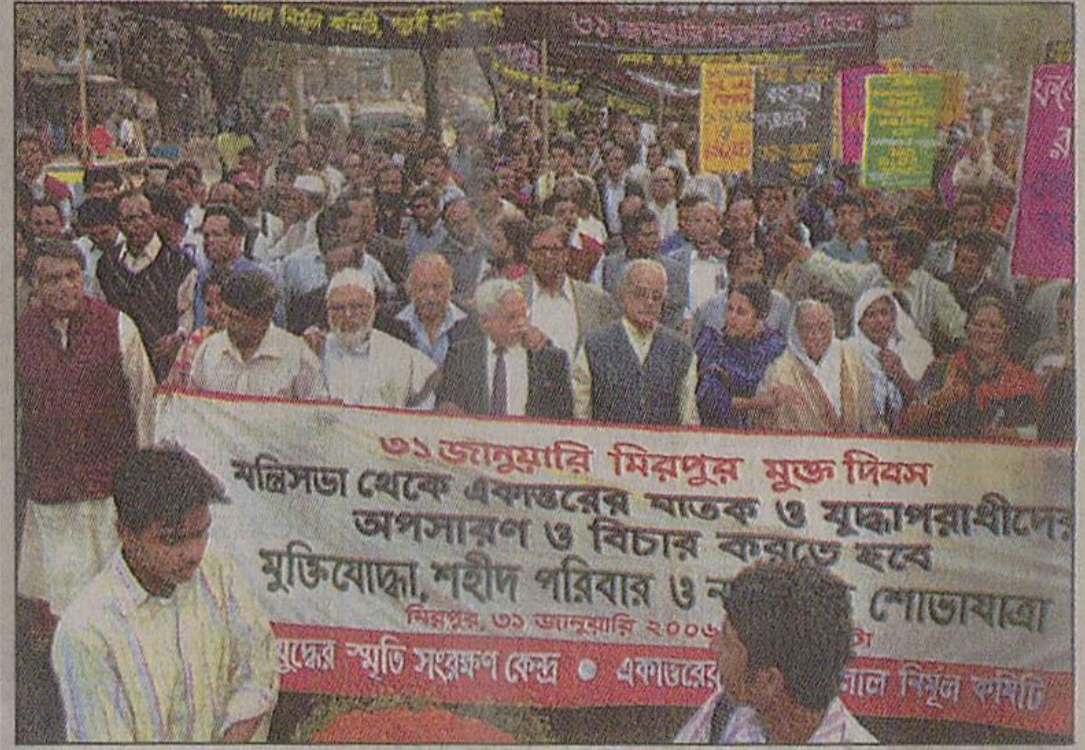
Freedom fighters and family members of Liberation War martyrs bring out a rally in the city in observance of Mirpur Liberation Day yesterday demanding removal of war criminals from the cabinet and their trial.

The government is going to take SEE PAGE 15 COL 6