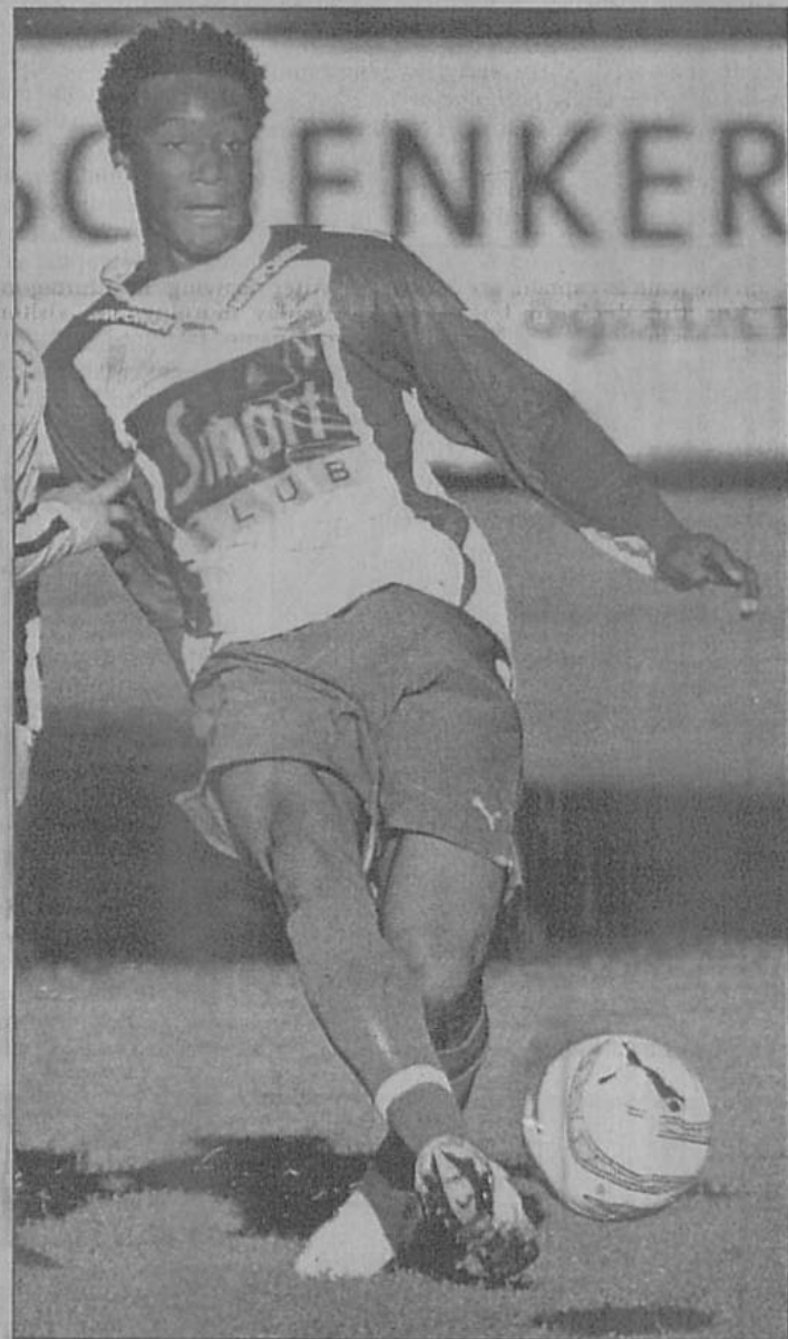
A file of Lyn Oslo's Nigerian recruit John Obi Mikel.

Chelsea have rebutted allegations of misconduct made by Manchester United in an eight-month-old letter to FIFA concerning John Obi Mikel that was leaked to the media on Monday.