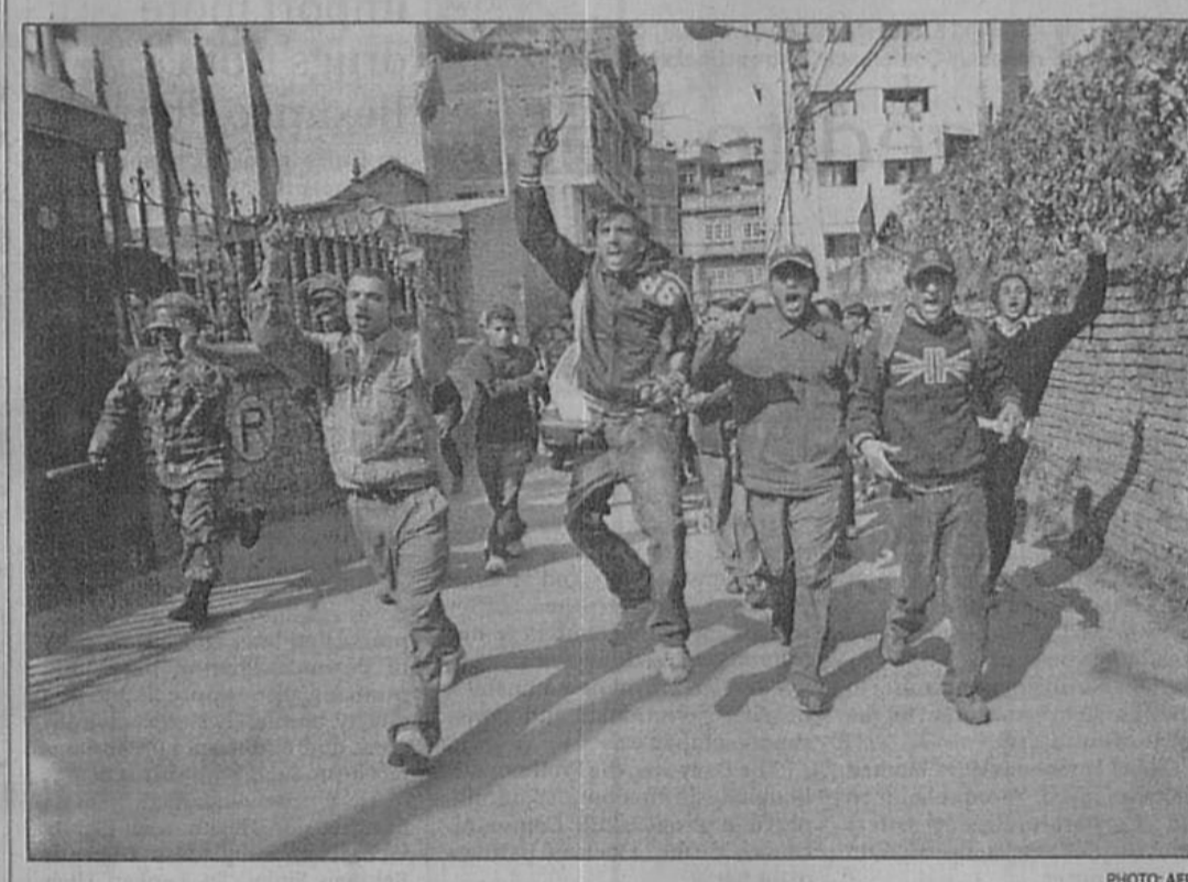
Flanked by riot police, Nepalese students shout anti-monarchy slogans on the streets of Kathmandu yesterday ahead of the first anniversary of King Gyanendra's power grab.