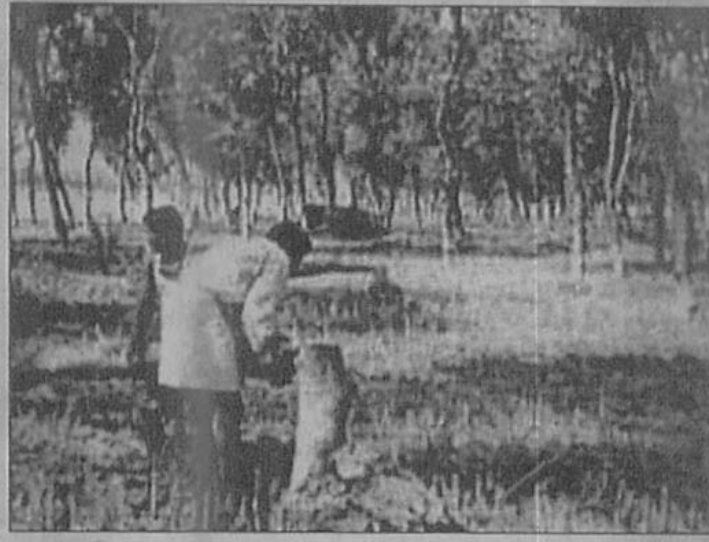
Trees being felled (left) in an encroached land and roots of trees in a land being prepared for shrimp cultivation in Cox's Bazar coastal area.

The authorities expressed deep concern over the JCD attack on the principal and demanded punishment of the culprits.