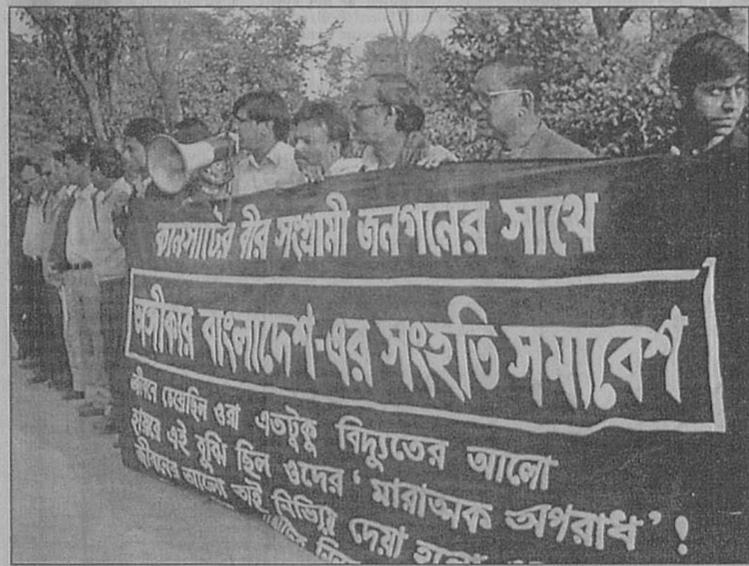
Angikar Bangladesh Foundation organises a rally at Doel Chattar in the city yesterday demanding punishment to the perpetrators of Kansat killings.

UNB, Dhaka The working sessions of the weeklong meet will have important discussions on professional training and research as well as formulation of a plan of action for the next one year to face disaster.