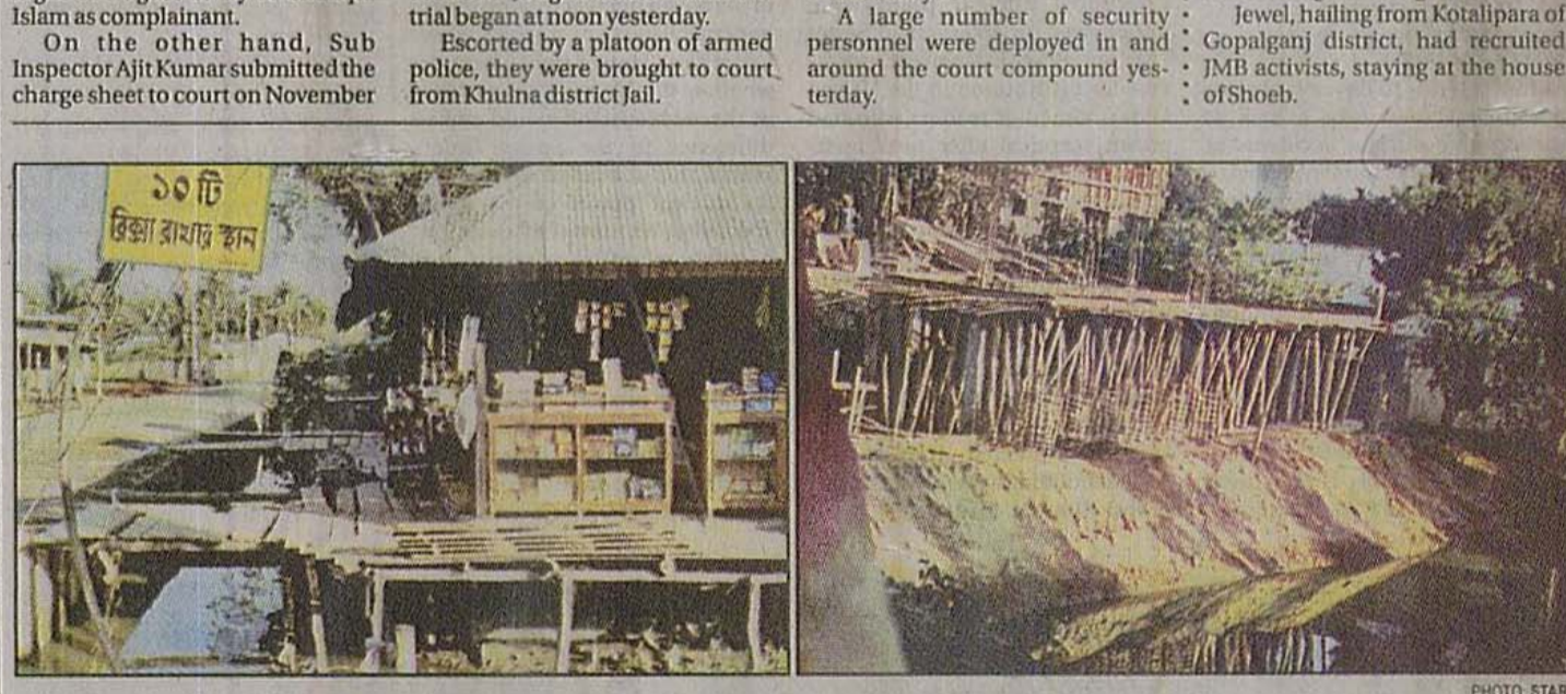
Shops built by encroaching on the Pankhaya canal (left) and a multi-storied building being built by filling the Kalabagan lake in Khagrachhari town.