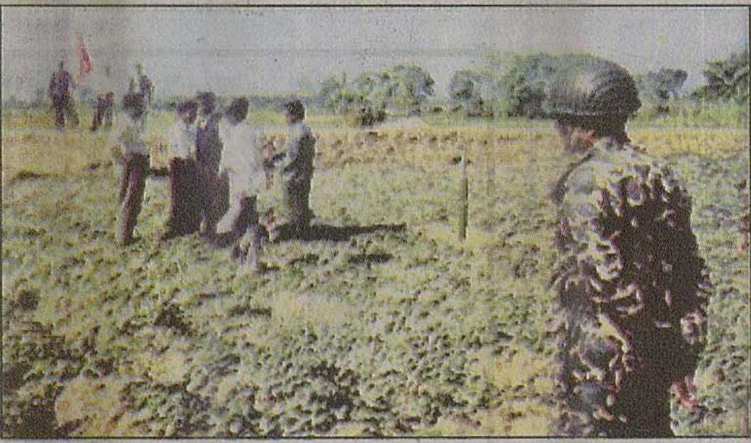
Officials of Bangladesh and India, assisted by BDR and BSF, surveying the occupied land in Ramgarh on Saturday.