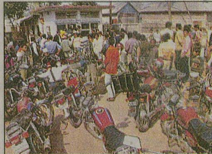
Motorcycle users scramble for fuel selling on a limited scale at a Kurigram filling station yesterday.