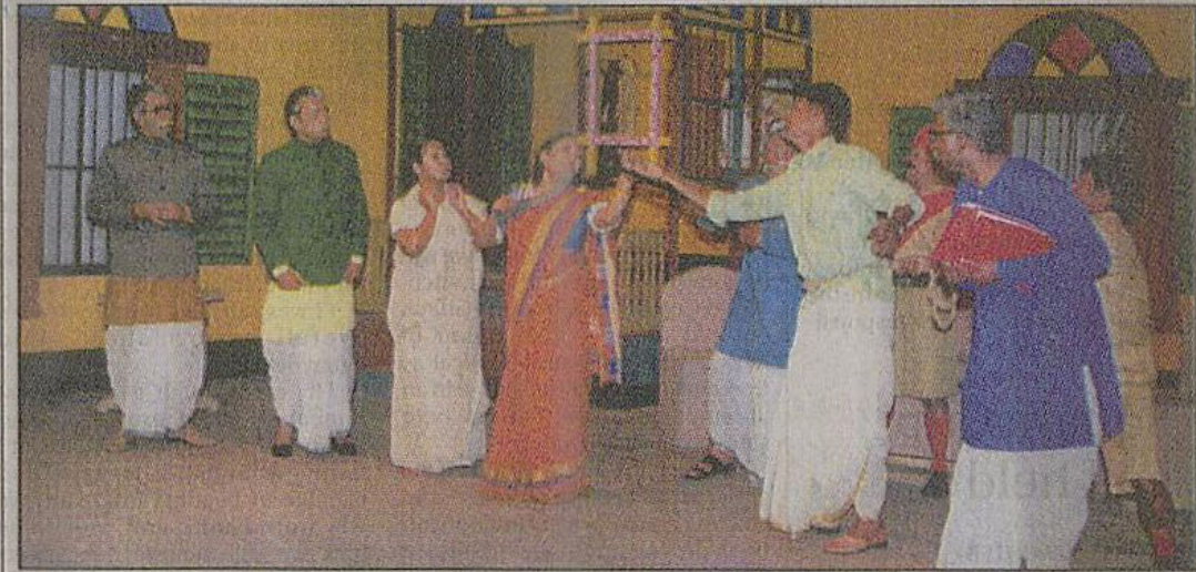
Actors in a scene from the play

Natyajan premiered Alik Babu on January 27 at the Experimental Theatre Stage.