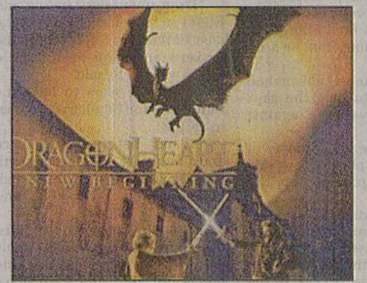
Dragonheart On HBO at 08:30 pm Genre: Action/Adventure Cast: Dennis Quaid, Dina Meyer, Jason Isaacs