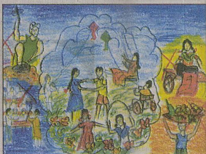
A selection of paintings by children