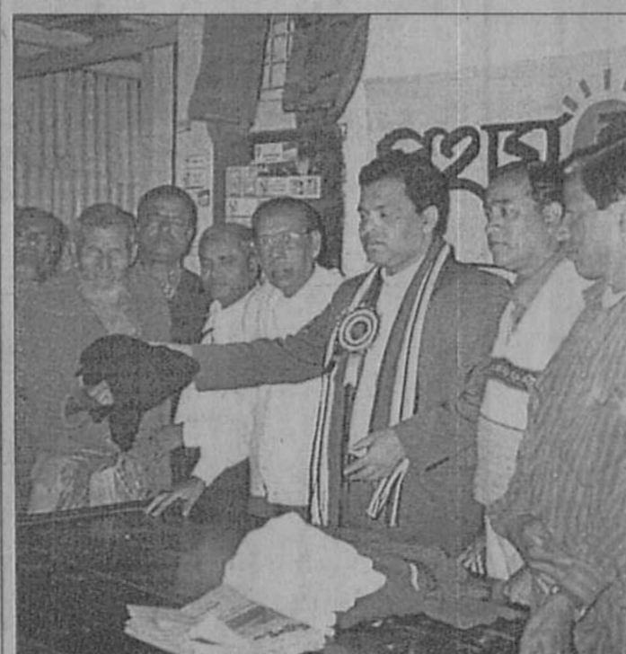
Prothom Alo, a leading Bangla daily, Friday arranged distribution of warm clothes among the poor in Patuakhali.