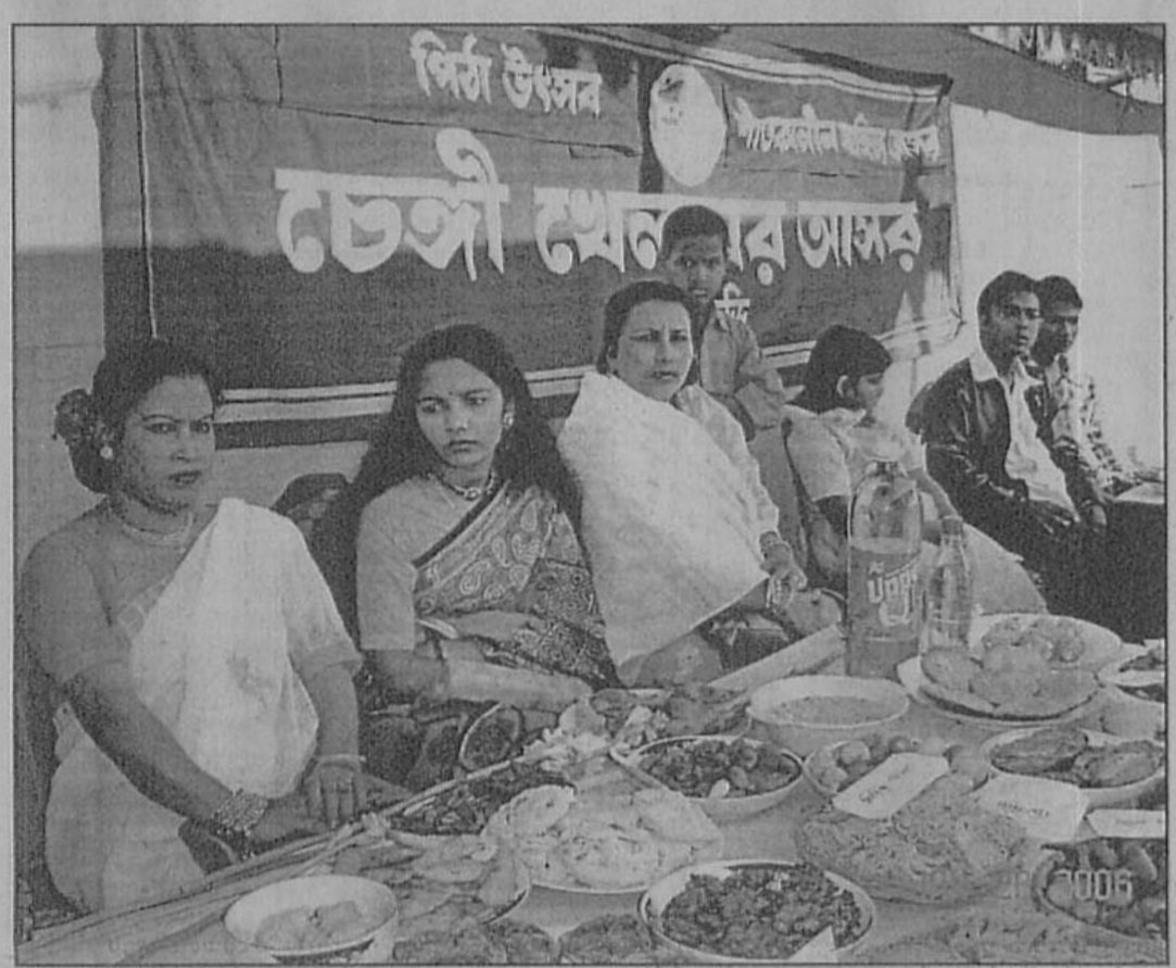
Khelaghar Ashar at Chengi, Khagrachhari yesterday organised winter cake festival and discussion on literature.