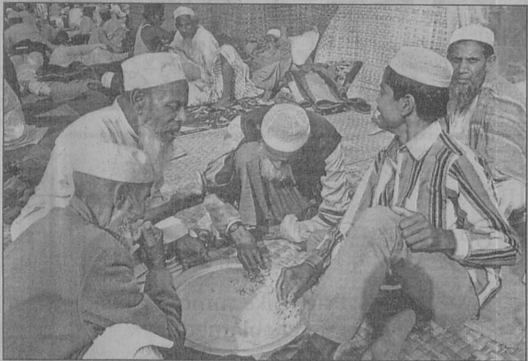
A group of devotees takes food in one plate on the ground of Biswa Ijmeta that began on the bank of Turag River at Tongji yesterday.