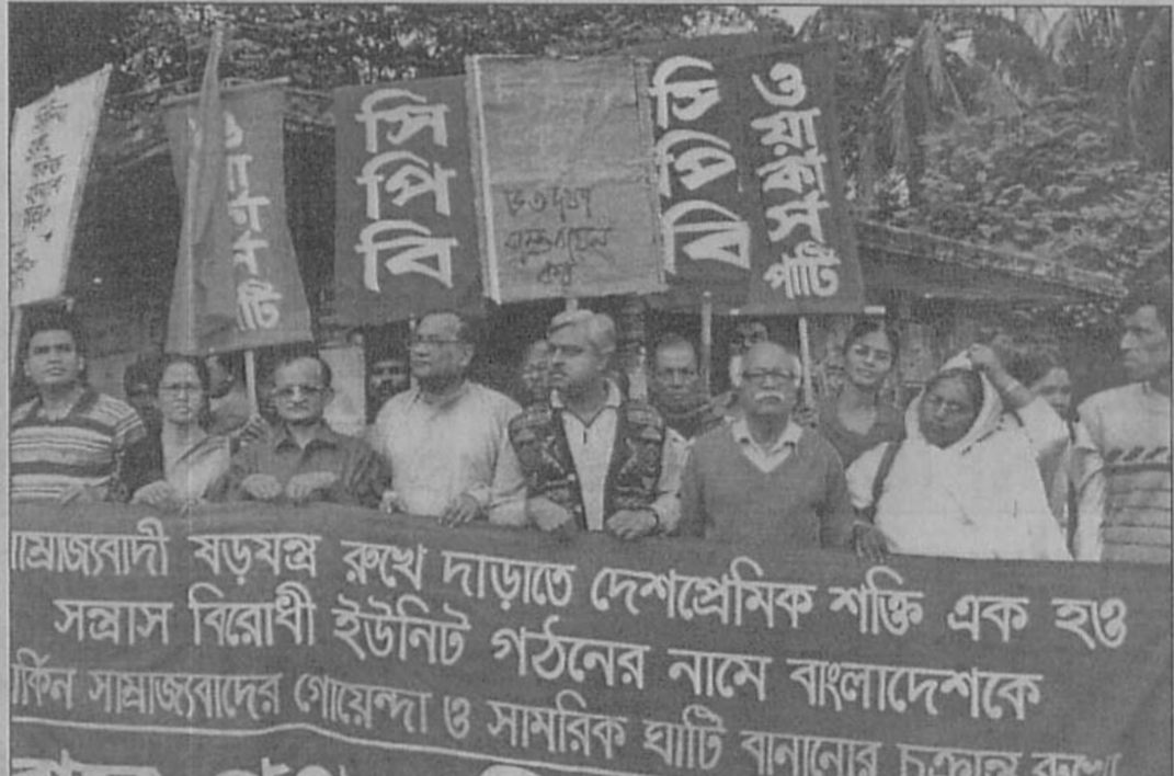
Left Democratic Front stages a demonstration at Mukhtangan in the city yesterday protesting the move to form anti-terrorism unit with the assistance of the USA.