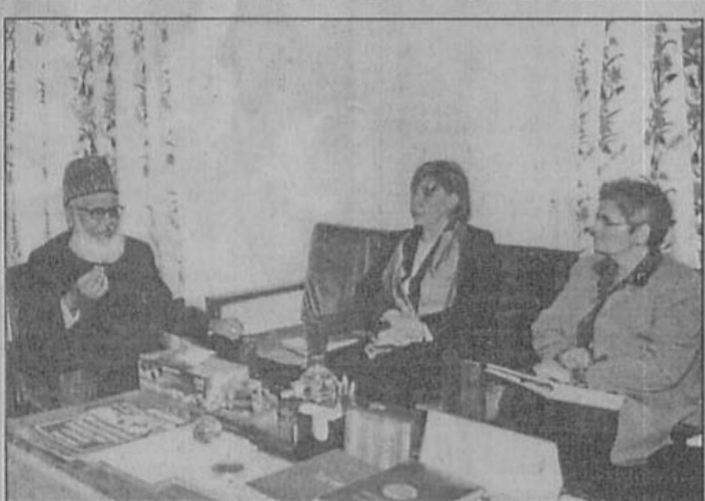
US Assistant Secretary of State for South Asian Affairs Christina Rocca held a meeting with Matuor Rahman Nizami, minister for industries and ameer of Jamaat-e-Islami, at the party's central office in the city yesterday.

database will provide information about the passport holders for various purposes -- travelling, casting vote, job application, police verification, admission in educational institutions and other multi-functional services. Meanwhile, the International Organisation for Migration (IOM) has initiated several training programmes for the officials of the Passport and Immigration Department on how to use the computer technology developed for MRP.