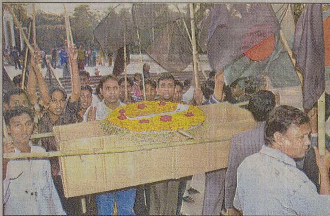
Carrying a symbolic coffin of slain Awami League leader and former finance minister Shah AMS Kibria, Sylhet Bibhag Unnayan Parishad stages a demonstration in the city yesterday demanding trial of the killers and protesting serial bomb attacks.