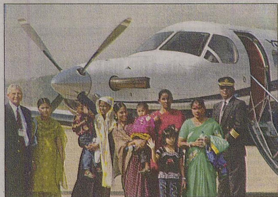
Ailing staffs and children pose for photograph with the officials of Youngone before boarding a private Air Ambulance at Chittagong Shah Amanat International Airport on Saturday.