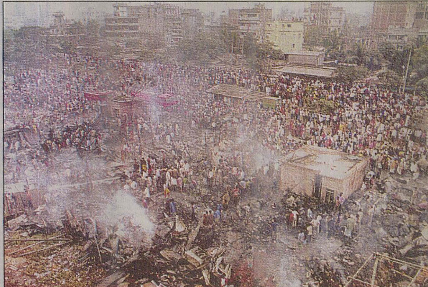
Remains smoulder after a fire gutted the shanties of Koratitola slum at Doyaganj in the city's Demra area yesterday.