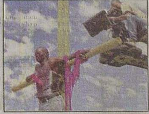
Son of Man being filmed

In the film, Jesus' resurrection is meant to signal hope for Africa, the world's poorest continent that is sometimes dismissed by foreigners as a hopeless mess of conflict and corruption.